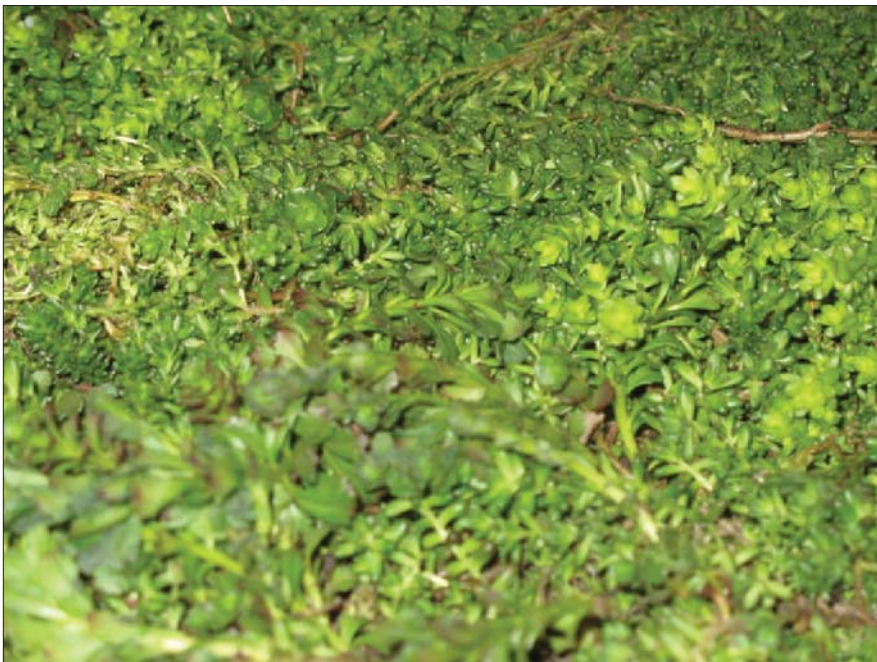
Photo Seven. (Below) Completion of the two-hour test at 110-mph wind.

will only measure the resistance of the underlying membrane system.