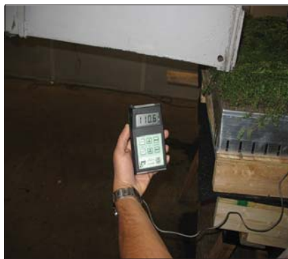
Photo Five. (Below) Checking the wind speed.

Section 1507, where specific ASTM standards are referenced. Basically, products installed on roofs need to comply with the appropriate standards for that product. This also is not new and is common practice. The changes creating concern are complying with sections 1504 and 1505.