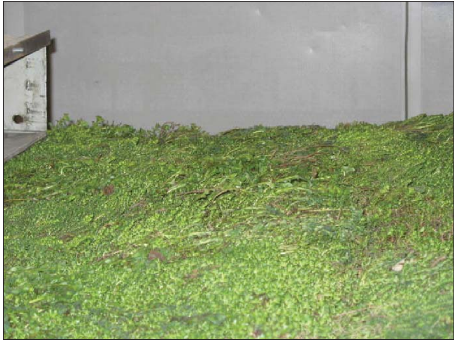
Photo Six. (Right) Sedum planting after two hours of exposure to 110-mph wind.

tems. Garden roofs have been installed on a wide variety of buildings and, in many cases, roofs were over 100 ft. above the base terrain. Major suppliers of systems report excellent performance of these systems over many years in both Europe and North America. The author, however, was unable to uncover any systematic study of wind exposure for garden roof systems. Also, little is known of the mechanisms of wind resistance for the various systems.