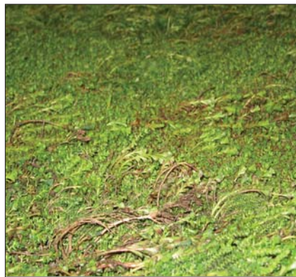
Photo Four. (Above) Sedum planting in a 110-mph wind.