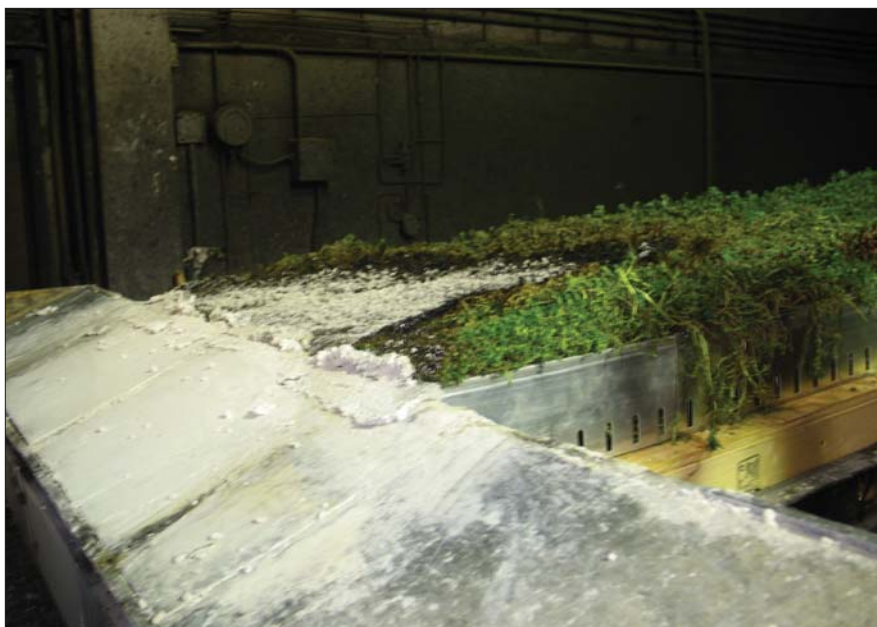
Photo Nine. (Below) Results of 10-minute ASTM E108, Spread-of-Flame Test. Fire only damaged the area of direct impingement. (Photo Courtesy of DLR Consultants).