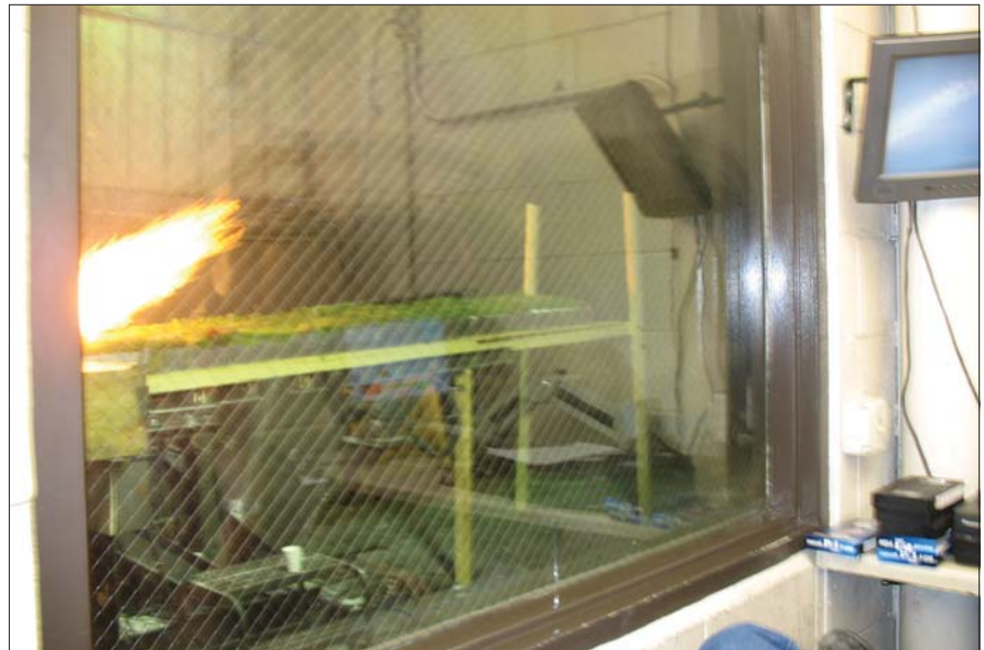
Photo Eight. (Above) ASTM E108, Class A Spread-of-Flame fire.

since the mid-1980s. One concept proposed by Idaho National Lab would have cost over $2 billion to install and huge sums to operate. 3 More recently, Florida International University has started a less ambitious project, but they are also finding it difficult to get support. Horsepower requirements for high winds are enormous. Should the wall get built, garden roofs could be tested. 4