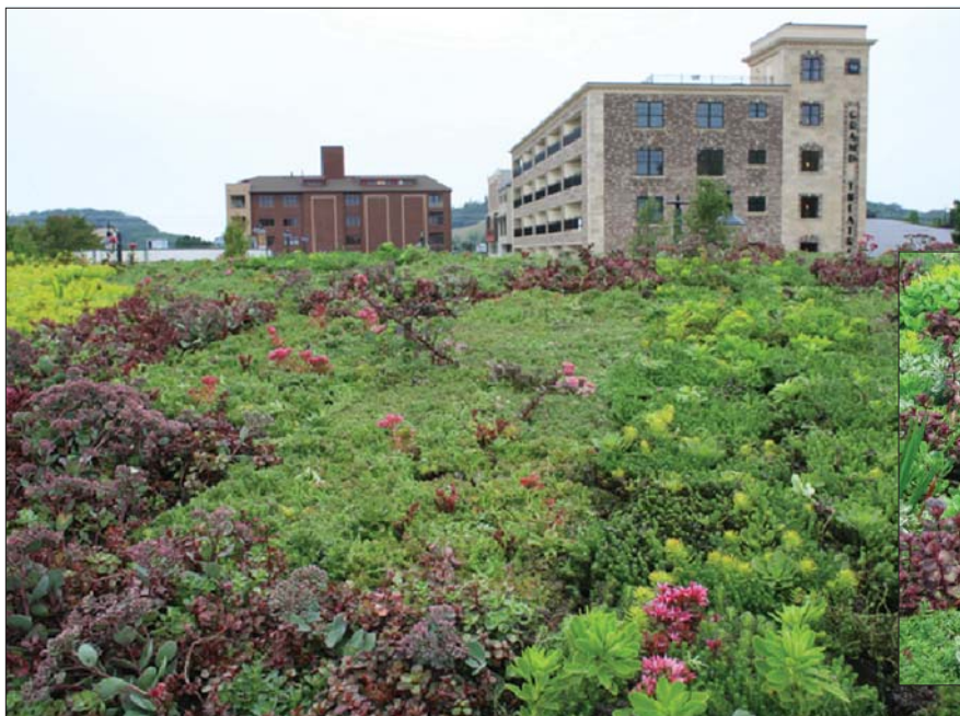
Photo One. (Left) Summer garden roof.

Garden roofs have become a popular system in many major cities, with Chicago leading the way. This has spread to many of the areas around Chicago, as well. Another area with a significant number of in-