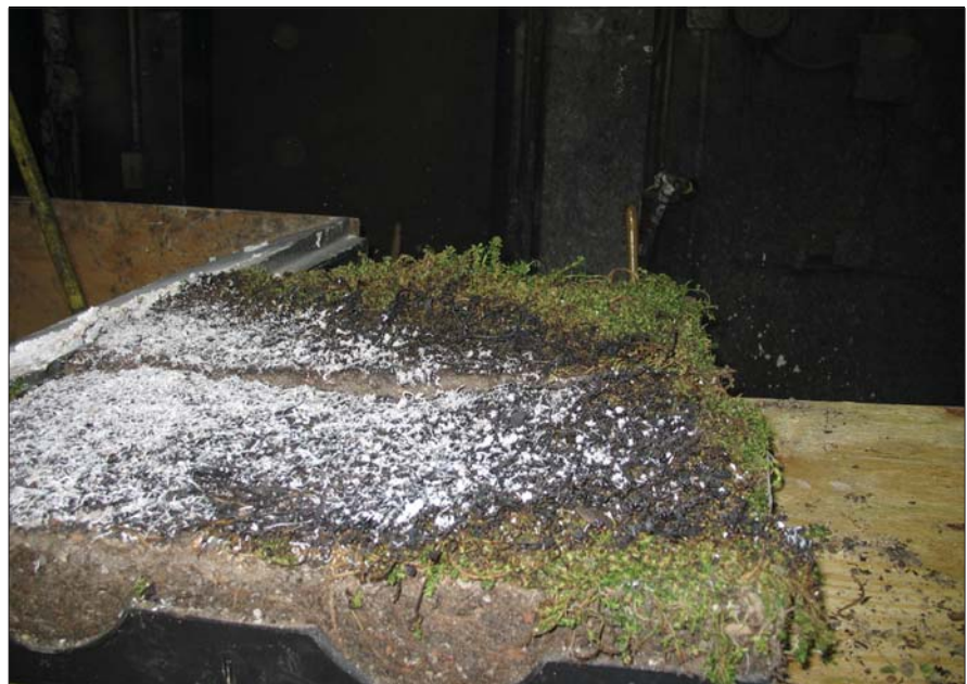
Photo 11. (Below) No damage to anything other than the top cover exposed to direct flame.