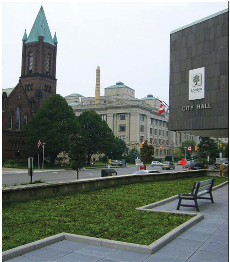
Photo 12. (Above) Garden roof in London.

The use of non-potable water creates problems. First, there is a large cost in setting up the collection system to get an adequate supply of non-potable water to the roof. Because of the cost and in order to meet the code requirements, systems might not be installed to water the roof. Fundamentally, roofs with thin soils and significant exposure to wind and sunlight create near-desert conditions. Sedums and other drought-resistant plants are typically chosen for the roofs, but they may not get enough moisture from rainfall. A well-ir-