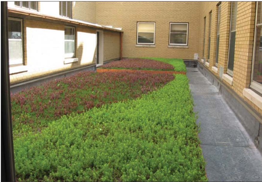
Photo Three. (Left) Interior garden.

place systems is the Washington, DC/Alexandria, VA, area. Ford Motor Company in Detroit has one of the largest garden roofs in the world at its River Rouge production plant. Western Michigan has one of the highest concentrations of Leadership in Energy and Environmental Design® (LEED) buildings and buildings with garden roofs in the United States.