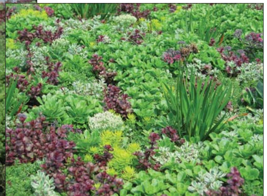
Photo Two. (Below) Close-up of typical Sedum..