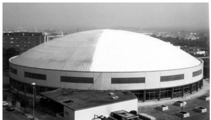
This metal roof is partially covered with a white coating. The coated half of the dome contrasts sharply with the uncoated half midway through the application process.

From the roof's perspective, the effect of scattering is the same as if the photons never arrived on the roof. This ability to reflect photons is characterized by the reflectance of a coating. Most white coatings have a very