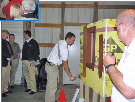
Various mock-up assemblies were applied to the testing chamber.

A total of 34 people were in attendance, ranging from engineers, architects, consultants, manufacturers, and contractors to property managers. Attendees received 2.0 RCI Continuing Education Hours (CEHs) for participating in this event.