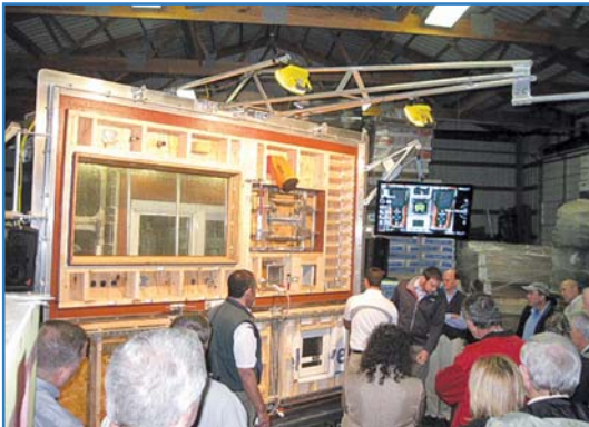
Self-contained mobile testing chamber.

The Carolinas Chapter of RCI, Inc., in conjunction with New South Supply, hosted a program titled "Refining Construction Details Through Design Verification Testing" at New South Supply in Columbia, SC. The program included a PowerPoint® presentation, interactive live demonstration of mock-up testing, and product application presentation by Prosoco.