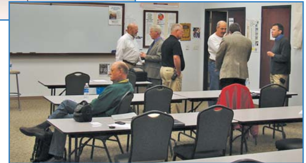
Meeting attendees network during a break.