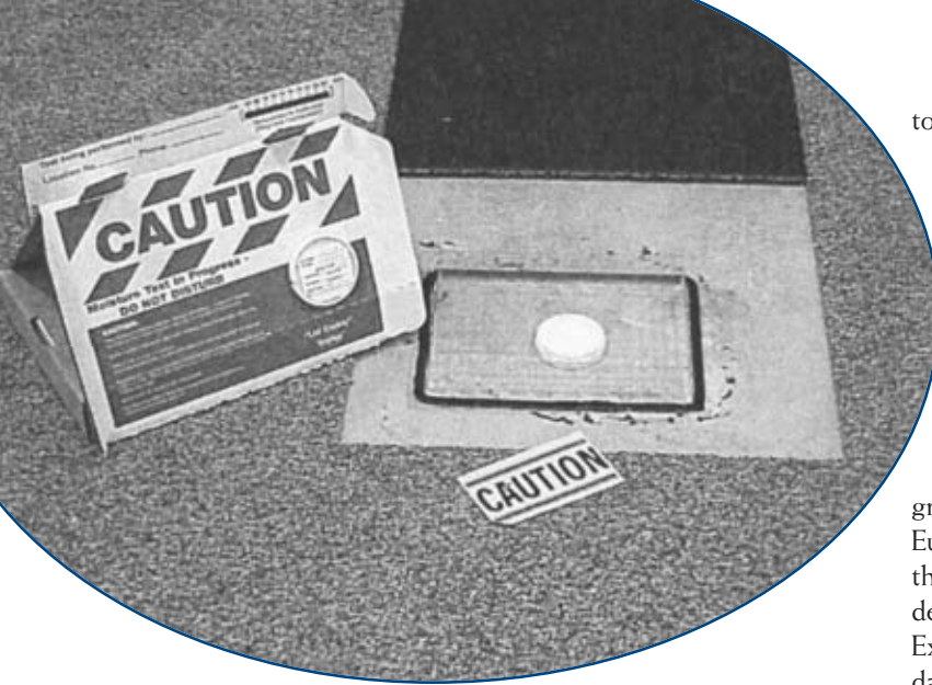
Figure 3 - ASTM F-1869 test being performed on a concrete floor.

Another common myth in the industry is that if the concrete is cured for 28 days, it will be suitable for application of liquid-applied membranes. Several membrane manufacturer application instructions indicate "fully-cured" or "28-day cured concrete" as the only moisture criteria for application of their membrane. The most important factor to consider is service environment. If the concrete has cured for 27 days and then is exposed to rain, the moisture content in the concrete will be increased to a level close to the initial moisture content and will require a longer drying time than concrete that is kept continuously dry. Other factors such as ambient temperature and humidity during curing will affect the rate of drying. The age of concrete does not correlate well with its moisture vapor emission rate (MVER).