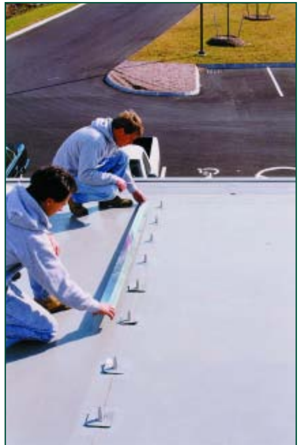
Post and rib installation.

Snow accumulation and ice dams also lead to leakage problems because they can cause water to pond on low sloped areas. Submerging a metal roof system in water and water back-up are major concerns because a metal roof is not intended to be waterproof and must rely on slope in order to shed water.