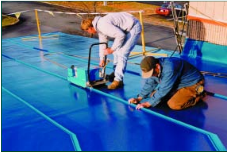
Welding rib in place.

Over the past several years, architects and designers have often used steep sloped roofing as a prominent architectural building feature. Prefabricated metal has been the most widely used roofing application for these roof areas. Although the metal panels themselves are attractive and watertight, as a system there are some issues that still need to be addressed by the metal roofing industry.