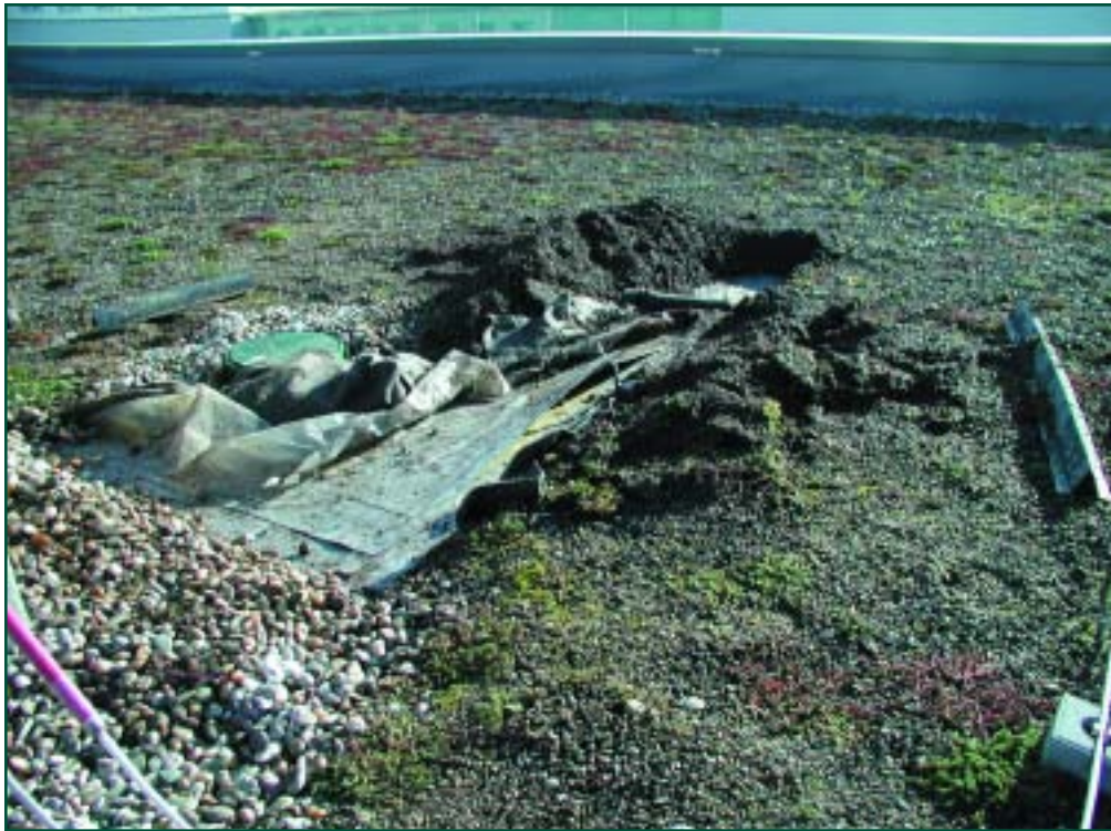
Figure 2: Leak investigation on a green roof in Frankfurt, Germany.