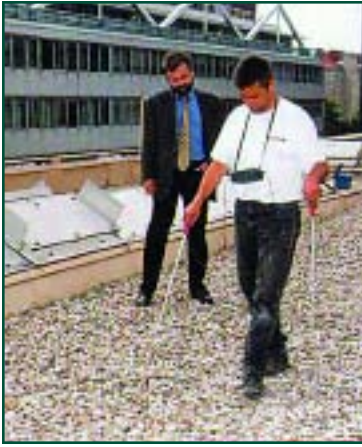
Figure 5: Leak detection procedure on an inverted BUR roof system. Locating breach through the ballast and insulation.