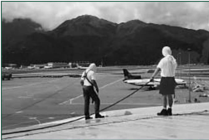
Figure 3: Leak detection at Chek Lap Kok airport, Hong Kong. Applying continuous flow of water on the sloped PVC membrane to facilitate the test.

EFVM has been used successfully with a wide range of waterproofing materials. AB Flachdach, a leak detection company in Germany, has electronically surveyed in excess of 35 million square feet of roof membrane within the past five years. The suitability of EFVM depends on the electrical resistance of the waterproofing materials. As an example, EPDM membranes, which contain carbon black, are generally not suitable due to their normally all-too-high electric conductivity. Aluminized protective coatings, commonly used in North America in conjunction with modified bituminous membranes, may also defeat the technique. However, International Leak Detection Ltd., a North American affiliate of AB Flachdach, can conduct bench-scale tests in order to establish that EFVM is suitable for a particular waterproofing material. EFVM can be used on all types of structural roof decks, including metal, concrete, and wood. (A special "grounding grid" must be introduced on top of the wood deck in this case.)