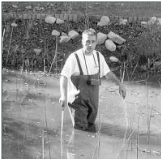
Figure 4: Locating leaks in a geo-membrane liner with the EFVM technique.

The EFVM method has proven highly advantageous in situations where the waterproofing is concealed or buried. These include IRMA (Inverted Roof Membrane Assembly) configurations, plaza installations, ballasted roofs, and "green roofs." Green roofs are veneer landscapes installed on top of conventional roofs. They may be anywhere from 2.5 inches to 3 feet deep.