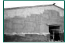
Figure 7: Effects of UV exposure. Lighter SPF was applied several days after the darker SPF.

If left exposed indefinitely, the dusting SPF surface will wash off, and eventually the thickness of the SPF will begin to diminish. Field studies suggest that the SPF may be left exposed for up to six months without deleterious effects. If the construction schedule suggests that the SPF will be left exposed for longer than six months, the foam may be thinly coated with an acrylic coating or the specified foam thickness can be increased by 1/4 inch.