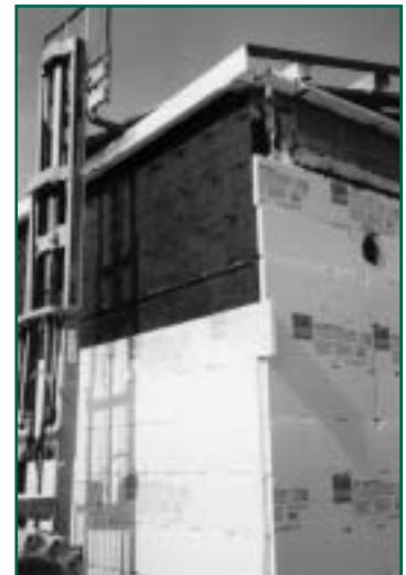
Figure 2: Conventional dampproofing and insulation.