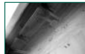
Figure 5: Note the tight seal developed around the roof trusses and the roof-wall juncture.

Hogan (1996) emphasized the need for air sealing the roof-to-wall juncture. SPF conforms to difficult shapes such as fluted metal roof decking and is an ideal material to accomplish this seal. If the roof trusses extend through the CMU wall, these penetrations can be sealed as well. This creates a continuous and seamless barrier from the roofline to the wall surface along the entire outside perimeter. Thermal, moisture, and air leakage at these tricky architectural features can be totally eliminated.