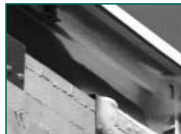
Figure 4: SPF application at the roof-wall juncture. The spray pattern can be seen at the lower right corner of this photo.

In addition to providing dampproofing and insulation, SPF offers additional benefits as an air barrier. SPF wall assemblies were tested in accordance with ASTM E 283 ("Standard Test Method for Determining the Rate of Air Leakage Through Exterior Windows, Curtain Walls, and Doors Under Specified Pressure Differences Across the Specimen"). The first assembly consisted of CMU blocks with 0.375-in. mortar joints and a one-inch thickness of SPF. The second assembly consisted of exterior drywall sprayed with a one-inch thickness of SPF. ASTM E 283 allows an infiltration rate of 0.06 cfm/ft 2 at a pressure differential of 1.57 psf. (During the test procedure, no leakage was detected at 1.57 psf, so the pressure was increased to 6.24 psf.) Test results of the two assemblies are shown in Table 2 .