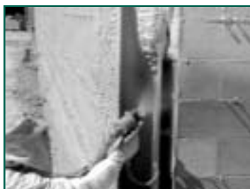
Figure 3: SPF readily fills construction voids.

For example, to achieve an R-10, a 1.5-inch thickness of SPF will provide sufficient R-value to replace 2-inch thick polystyrene board.