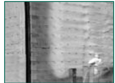
Figure 1: SPF application to CMU wythe.

SPF is closed-cell and does not readily absorb liquid water. To verify its resistance to moisture penetration, 1/2-inch thick samples (triplicate) were tested using a Suter Hydrostatic Pressure Tester in accordance with AATCC 1 Test Method 127 Water Resistance: Hydrostatic Pressure Test . In this particular test, a hydrostatic head of 55 cm (22 in) was maintained for five hours, after which the head pressure was raised at a constant rate of 1 cm/sec (0.4 in/sec) until failure or maximum hydrostatic head pressure was reached (failure is indicated by the appearance of three water droplets on the bottom surface of the specimen). All three samples tested reached the maximum hydrostatic pressure of 184.9 cm (72.8 in) without failure.