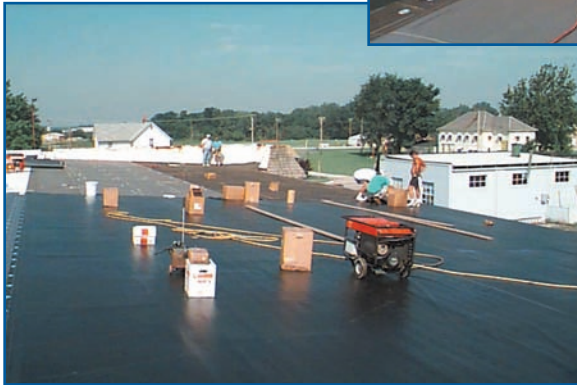
Installing black TPO sheets on east side of church roof.

polystyrene could be used over and over indefinitely. Removal to the landfill would be an unnecessary expense, a disservice to the owner and environment, and a violation of sustainable building principles, which include a call to reduce, recycle, and reuse. Reusing the existing insulation during reroofing also makes it less expensive to meet or exceed energy code requirements.