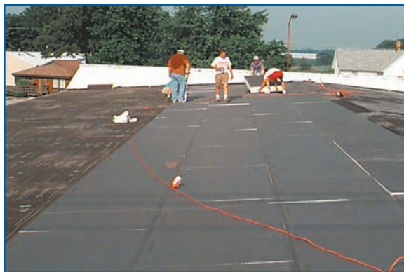
Layout of "cool black" TPO sheets on west side of church roof.

have played a role in the positive outcome of the experiment. It was decided to identify another building for re-cover, this time using wood fiberboard in some areas and polyisocyanurate insulation in others.