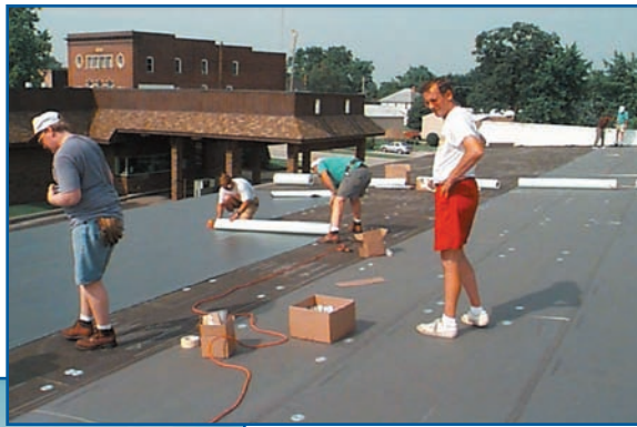
Church members assisted in the installation of the roof systems.

Consequently, even greater care should be given to deciding whether or not to tear off a roof containing polyiso insulation or other closed-cell foam plastic insulation that is placed directly over a permeable deck. In certain roof systems, undamaged insulation, including polyiso, molded expanded polystyrene, and extruded