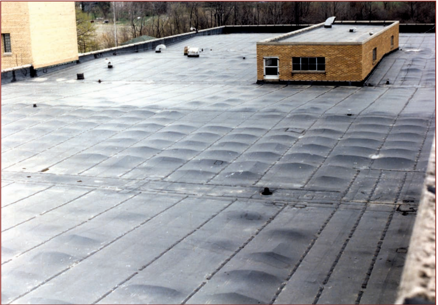
Dimensionally unstable foamed plastic insulation resulted in a failure investigation at this plant in Michigan.