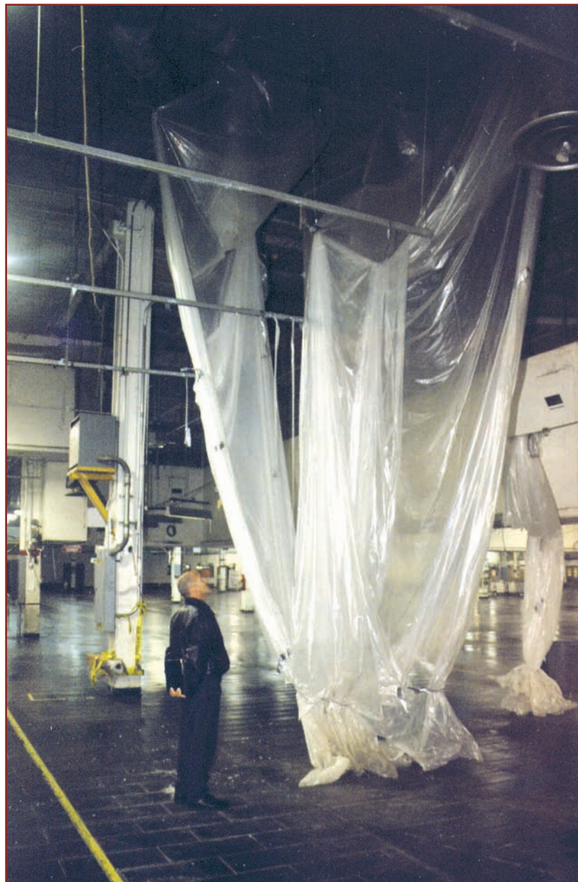
A roof consultant views an interesting protection arrangement in this leaking building.

pendent professionals in roof design set the stage for the principal issue addressed in this article: When no roof design professional is involved with a roof that fails pre-