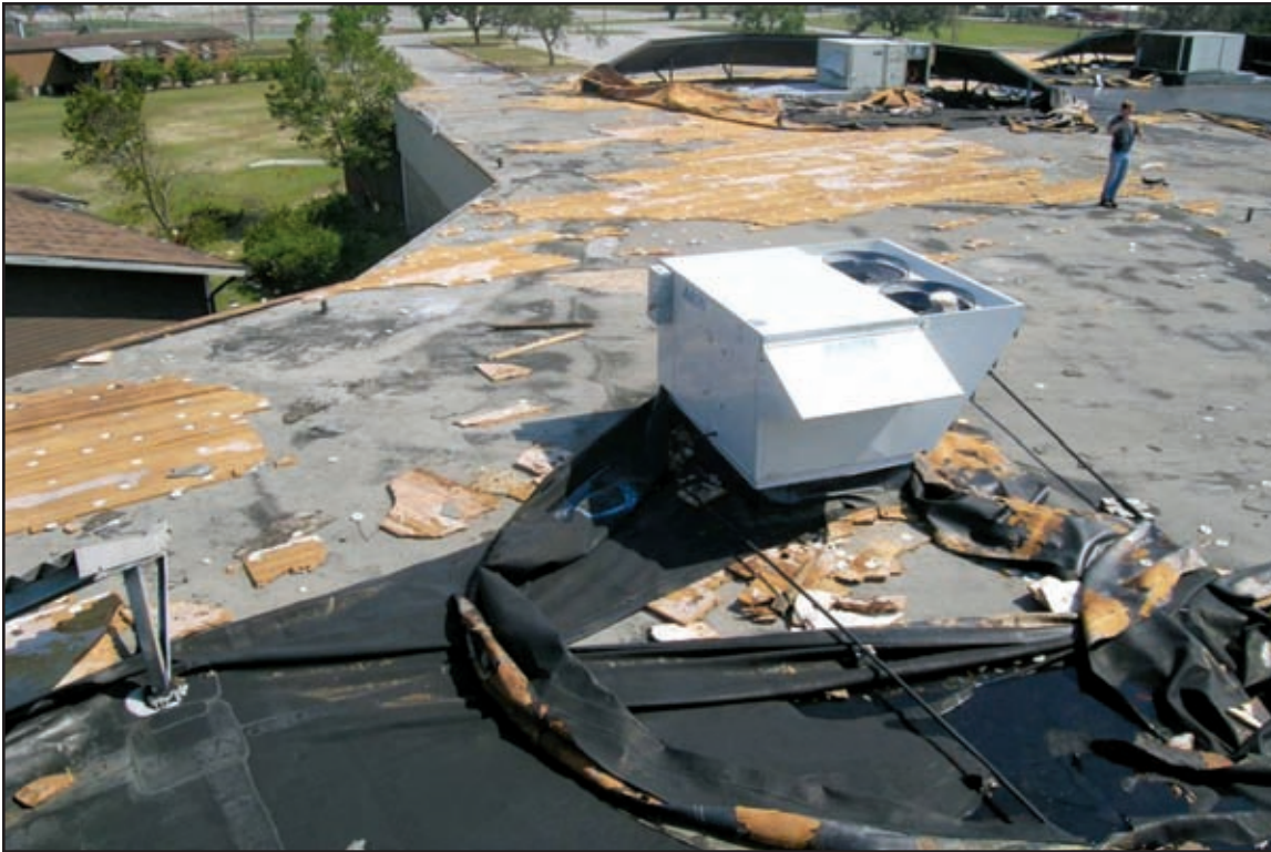
Pensacola School Building 2: Cleat deformed, edge metal lifted, membrane peeled. Cleat gauge less than currently recommended by FM Global LPDS 1-49 and ANSI/SPRI ES-1. Corrosion of roof edge fasteners contributed to expansion of edge damage into field.

mised after walls or windows were damaged, providing uplift to the roof in excess of what the building was designed to endure.