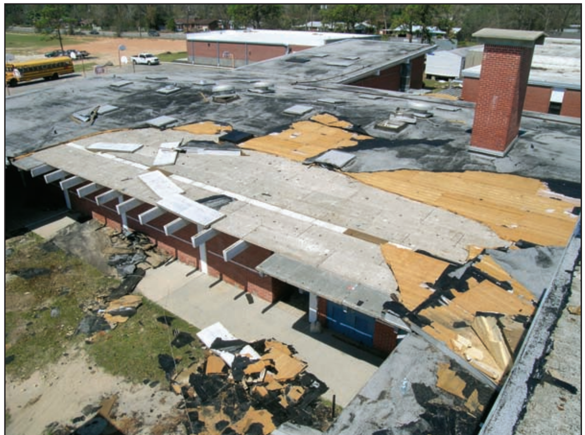
Pensacola School Building 1: RICOWI inspectors found pressurization and billowing at overhangs. There were cleat deformations and disengagement of edge metal. The cleat gauge was less than currently recommended by FM Global LPDS 1-49 and ANSI/SPRI ES-1. Corrosion reduced effective uplift resistance. Overhangs need to be designed and constructed to resist higher loads.

That was just one preliminary finding by RICOWI, but the emphasis of the mission was to formally document the performance and damage that occurred to roofing systems during substantiated hurricane-level wind speeds.