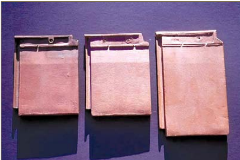
Photo 6 – The devolution of tile surface features: Three generations of tile from the same manufacturer show loss of surface articulation from a circa 1951 roof tile (left) to its later (center) and contemporary (right) counterparts. On the earliest tile (left), note the raised hub at fastener hole to protect fastener hole from leakage and deeper drainage channel (indicated by longer shadow from back leg of top channel). These features are muted or eliminated on later tiles to right.

grade by region. At a minimum, designers should adhere to the grade recommendations of ASTM C 1167. We recommend only specifying and using Grade 1 tile in northern climates, and whenever possible, we prefer to use Grade 1 tiles for increased durability in less severe climates.