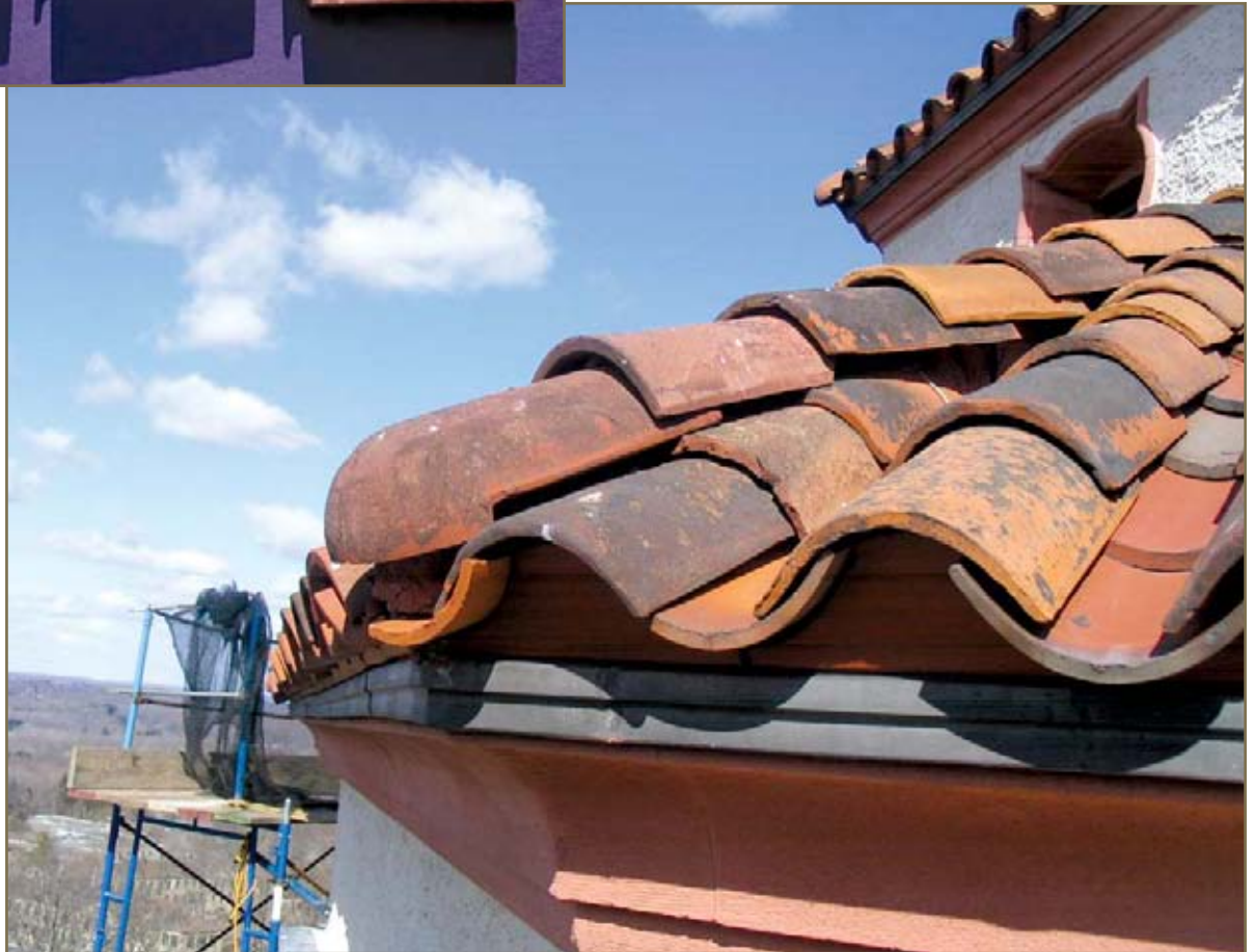
Photo 7 – Accessory tiles, such as the rounded hip closure tile shown above (or tiles for ridges, rakes, and starter courses) are often available from manufacturers for various tile shapes and styles. In some cases, these require special order and have considerably longer lead times than typical field tile shapes. Identify and order accessory or custom tile shapes early to avoid delays during construction.

Gateway requirements for the performance grades were established to limit the need for freeze/thaw tests, which may take ten weeks or longer to complete and are often too long to allow testing of the actual batch of tiles intended for the project, while still meeting construction schedules. We have found that these gateway absorption and saturation coefficients provide a good indicator of long-term tile durability under freeze/thaw weathering and general exposure. We have conducted laboratory tests on existing tiles that