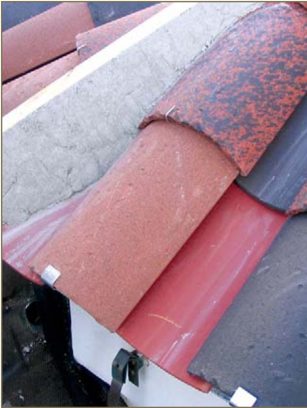
Photo 3 – Nose clips are used to resist uplift forces on tiles. The photo shows both a wire nose clip in the field of the roof (top) and a custom-manufactured nose clip along the roof eave (bottom). Custom-manufactured nose clips may be required to provide adequate stiffness and length to fasten above, rather than through, metal flashing along roof eaves.