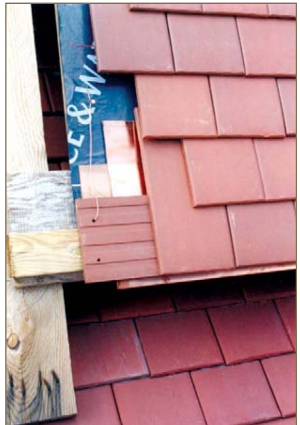
Photo 2 – Fastening eave and valley tiles (not shown) with wire ties can avoid penetrations through metal flashings, which would result in less reliable waterproofing performance.

On the other hand, mortars and mastics are traditional materials. Their traditional use was typically not as a primary means of attachment, but rather as a "hole filler" for edge tiles at rakes and valleys; to provide a closed, finished appearance; and to reduce nesting of insects beneath open tile edges. Mortars tend to have very limited adhesion to clay tiles. Mortar should not be used as primary clay tile attachment but can be used as a supplement to mechanical fasteners to reduce chatter and reduce nesting of nuisance insects (e.g. hornets, wasps) in edge voids. If left exposed or subject to water run-off, mortar may also produce unsightly white efflorescence staining. Mortar is also susceptible to freeze/thaw damage under these conditions and must be evaluated for durability when exposed to such conditions in service.