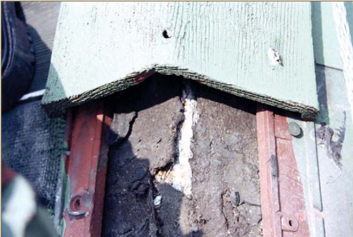
Photo 1 – Torn felt membrane underlayment. Asphalt-saturated felt embrittles with age and becomes prone to tearing.

brane underlayment sags into these voids and causes membrane seams to open, which leaves the membrane vulnerable to leakage. Further, out-of-plane irregularities and sharp edges of boards can cut or stress and prematurely wear membrane underlayments over time. In cases of skip sheathing or plank sheathing with wide gaps, we recommend covering with plywood to provide a smooth, clean, uniform substrate for membrane underlayment. For optimum adhesion of the membrane, prime the plywood and seal gaps between boards to prevent bridging and provide for continuous adhesion. Similarly, clean, prime, and seal gaps in tongue-and-groove sheathing prior to membrane installation for optimum adhesion and performance.