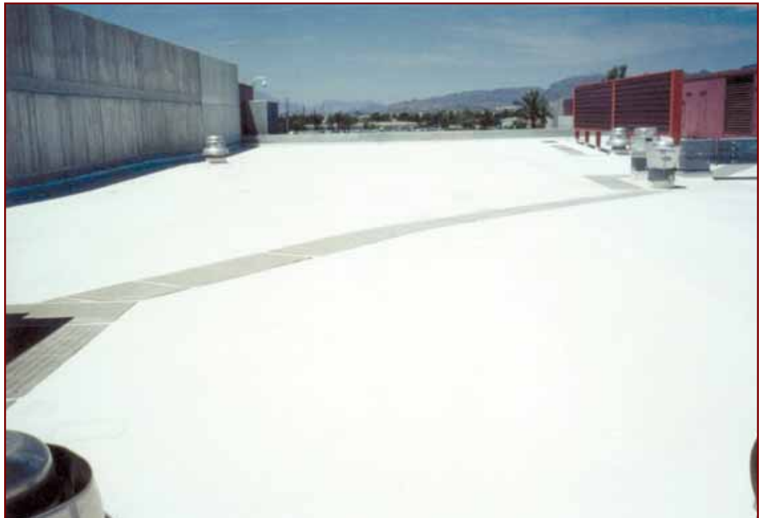
The granulated modified bitumen roof on this Intel facility in Chandler, Arizona, was coated with an elastomeric white coating.

The perm rating should not be confused with weatherability or resistance to weathering. A coating with low permeability still may require a protective topcoat to ensure satisfactory weathering resistance.