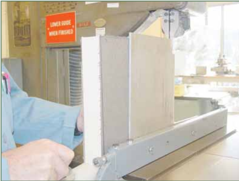
Left and Below: The “thin slice” method performed by PIMA.