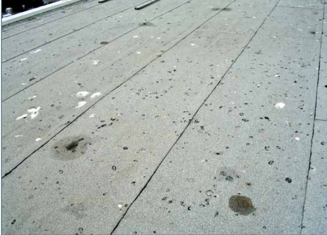
Photo 6 – This photo was taken after the roof had been well washed by rain. The small, round marks are typical of granule loss damage to modified bitumen membrane caused by gull droppings. The larger, “splotchy” marks exhibit damage to the actual membrane, down to the reinforcing, in some locations. Some of what these birds eat and defecate dissolves or softens asphalt!