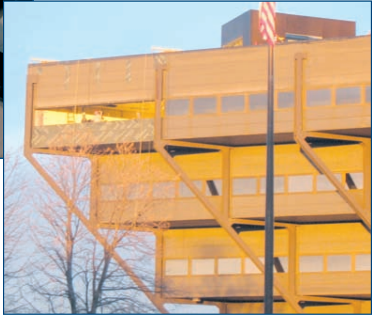
Photo 3 – Photograph of ribbon/strip windows; installation in progress.

assemblies can be wept down into a sub-sill to mitigate some of the risks associated with providing exposed weeps at the face of smaller, more “leak-sensitive” glazing pockets.