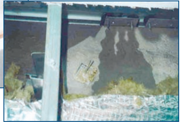
Photo 8 – Heavy leakage is shown through a splice in the sub-sill (shown in Photo 7) due to failed seal with irregularly spliced material (viewed from interior and below, with interior finishes and insulation removed to expose the leakage).