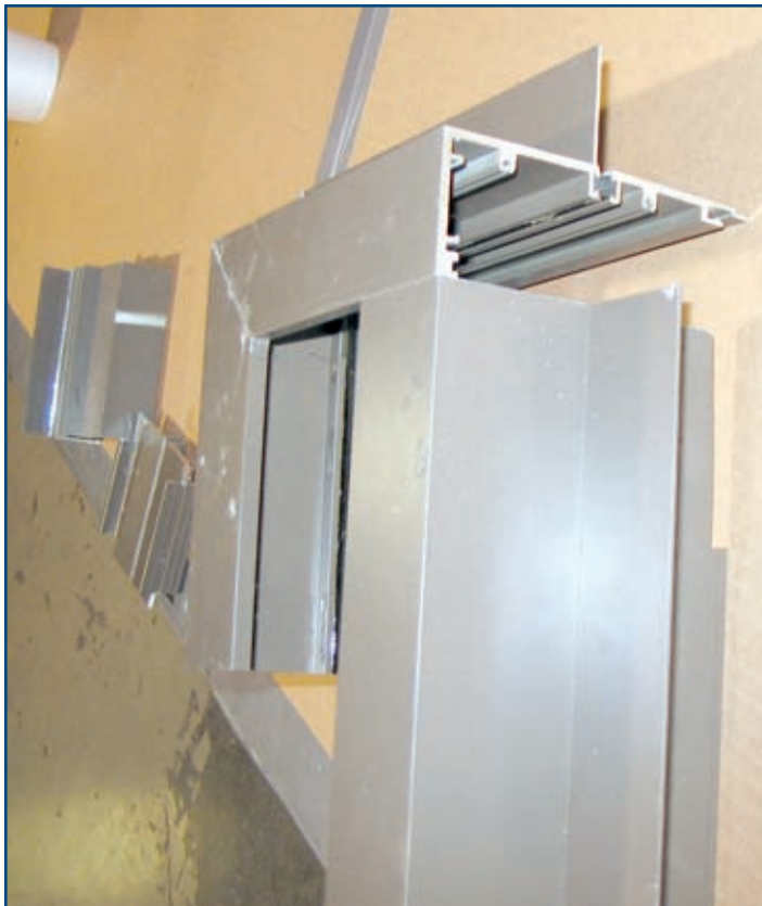
Photo 4 – Sample receptor frame intersection; note the open corner.