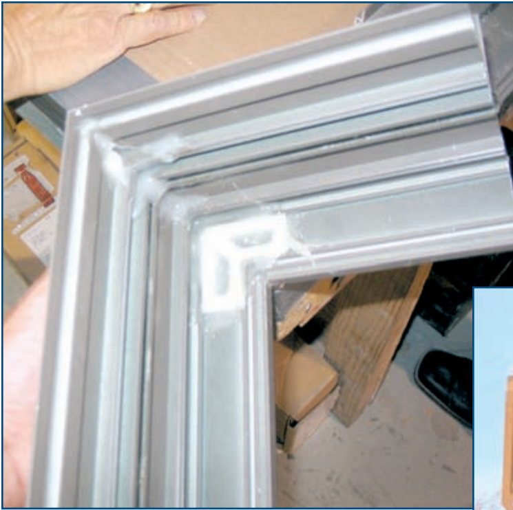
Photo 2 – Sample mitered receptor frame corner intersection; corner is keyed, fastened through screw bosses, and back-sealed.