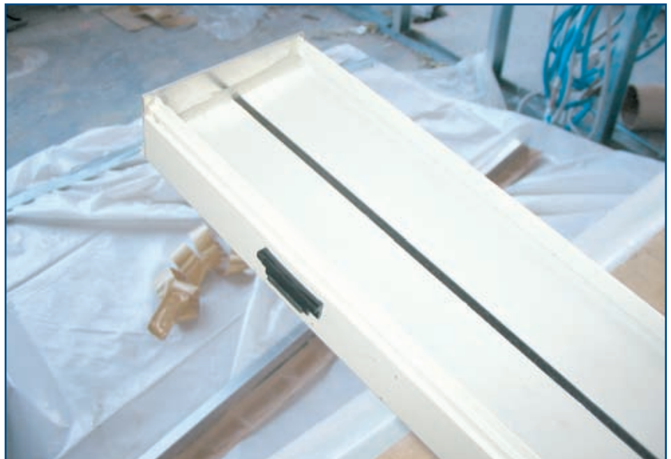
Photo 1 – Sample sub-sill with sealed end dam installed. Also note the black weep cover (which covers a slotted weep hole) and the slope to the exterior.

If a sub-sill or similar flashing condition is not provided to catch and drain this water, the system may leak from the time of installation. By the same token, window