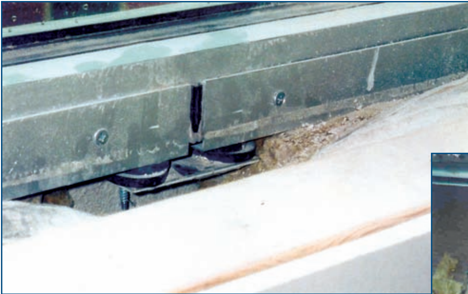
Photo 7 – Up-close view of a splice joint in a sub-sill (viewed from interior, with interior finishes removed). Note the corrugated profile of the splice material.