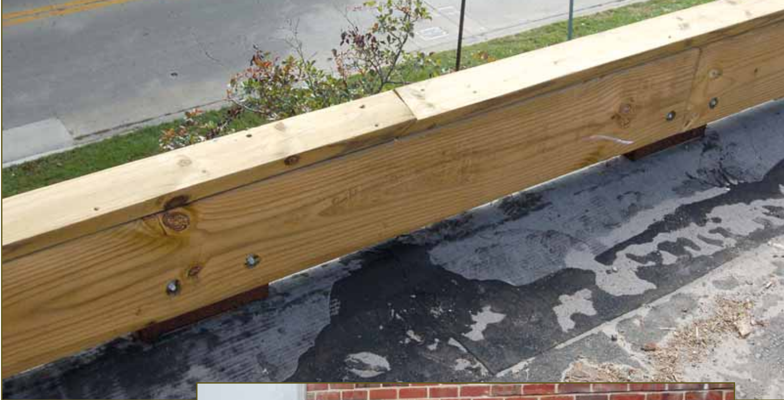
Photo 2 (above) – Energy conservation is a global crisis, so sustainable roof replacement should include the installation of substantial thermal insulation. Doing so often involves the raising of the perimeters. This photo shows one option preferred by the author in which vertical 2 x 12s are supported by steel angles and offset to provide a slope for the 2 x 4 cap. Note, too, that the wood blocking joints are not butted, but mitered at 45 degrees and screw-fastened. This prevents misalignment where wearing may occur.