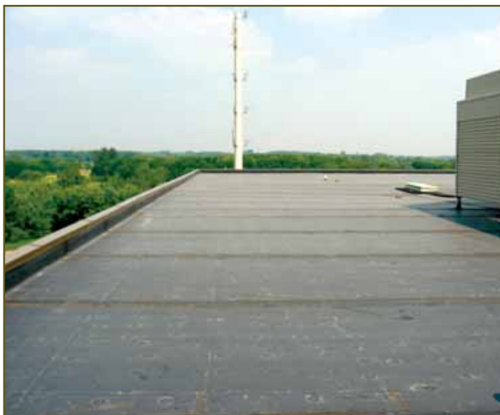
Photo 7 – Another view of the same roof in Photos 5 and 6.

These may include conditions found during the roof removal, such as deteriorated decking, buried conduit, and construction that differs from that which was assumed. Additionally, weather issues need to be considered. Installing roofing in inappropriate weather cannot be tolerated. If observed or discovered, such work should be rejected. We all have horror stories of a