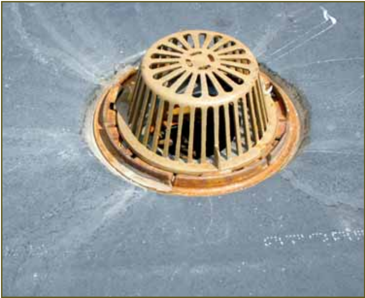
Photo 6 – This shows drainage areas on the roof in Photo 5.

Prior to releasing the contract document for bidding, this author recommends pre-qualification of contractors to confirm their suitability and qualifications for the particular project. Do not post the project with organizations that list projects for bid. Be selective and eliminate the unqualified early in the process. A poorly qualified contractor can lead to less than desirable results.