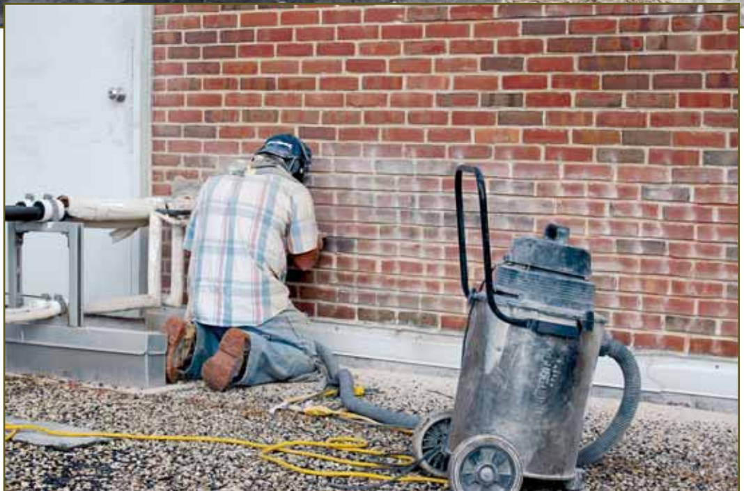
Photo 3 – Dense coverboard protection over low-density insulation is recommended by the author below both fully adhered and mechanically attached membranes in order to promote long-term protection to both the insulation and roof cover.