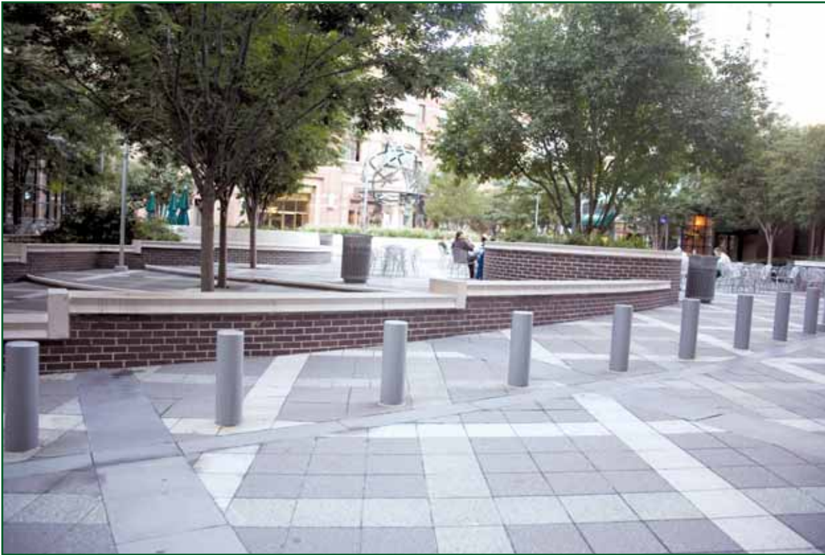
An 80,000-sq-ft open plaza area in New York City with difficult vertical flashing details required a seamless membrane, with many parts being covered with soil. The track record and ability of the waterproofing and roofing membrane to protect high-end businesses located below the plaza area were key factors in the product's selection.

plants are incorporated into the green landscape. This type of green roofing requires regular landscaping maintenance, supplemental irrigation systems, and periodic fertilizing, but it also allows for great design flexibility.