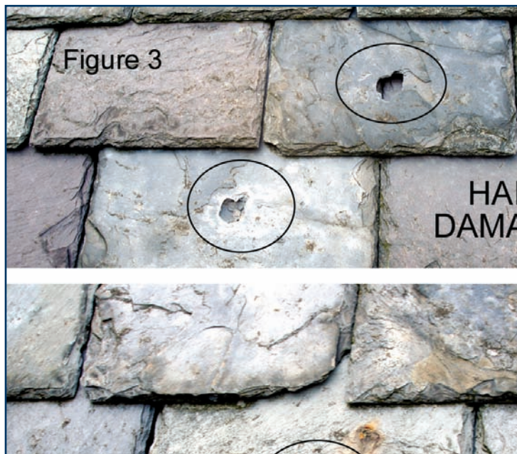
Figure 3 – Hail-perforated slates should simply be removed and replaced. Hail damage rarely justifies replacement of an entire slate roof.