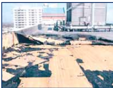
Hurricane Charley. Severe wind damage with weak bond between membrane and insulation.

Part of the roofing industry's reaction to FM's changes has been to increase its reliance on ASCE-7. This has prompted FM to change some of the details in the Class I