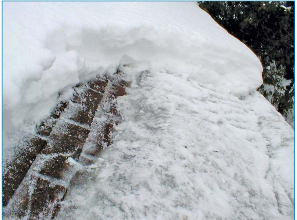
Ice dams can continue up-slope from horizontal.

Keep in mind that the best ventilation system can be ineffective if there is excessive heat loss into the attic or ventilating airways of cathedral ceilings. Since all of the reinsulation efforts after the first oil embargo of the 1970s, great improvements have been made in the depth of insulation in