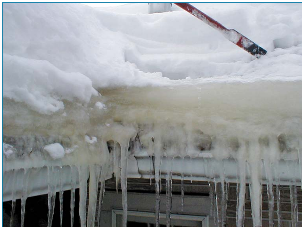
Ice dams can be more than 2 ft thick.

Some of the ice dam protection membrane failures the author has witnessed have been due to wrinkles and back laps