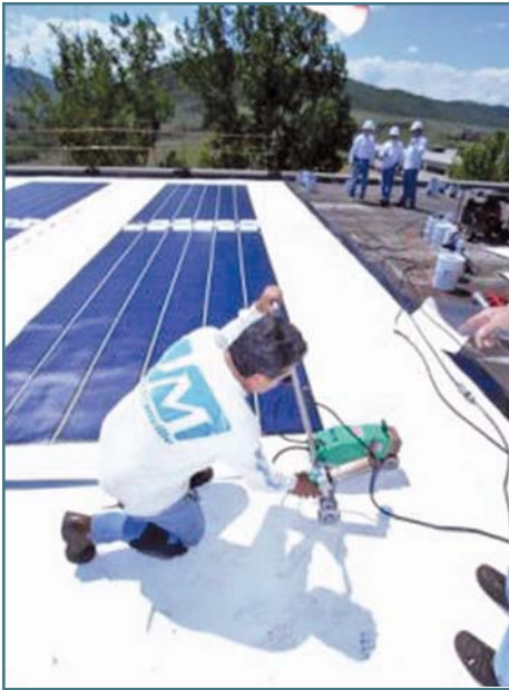
Photovoltaic modules being installed onto an existing bituminous roofing system.

or “white,” and they are said with ever greater frequency. Bituminous systems can be coated white in the field, but single plies come coated white from the manufacturer.