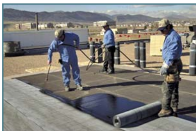
Cold adhesive being applied with a spray rig.