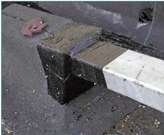
Liquid-applied flashing installed on an angled support beam of a tilt-up wall.

Bituminous roofing also offers alternative solutions when there is no staging area for a kettle/tanker or if disposing of numerous empty five-gallon pails is undesirable. Let's first discuss heat welding or torching. Torched bituminous systems have been a recent development (when you consider bituminous roofing has been around for over a century), and they offer an alternative to building owners who do not want the sight of a kettle on the premises. Torching allows the contractor to achieve a hot bond between plies without all the extra equipment of luggers, mops, hoppers, etc. Instead of having to man this equipment,