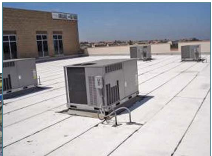
Factory-coated white cap sheet installed. Note color difference between white cap sheet and standard color flashing material (installed on curbs).