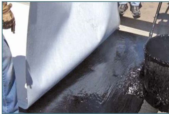
Fleece-backed single-ply being set in hot asphalt onto bituminous plies.

While all of these systems have wind uplift approvals, bituminous assemblies lost some of their “bite” when recent guideline revisions restricted the ability to increase fastener densities in insulation attachment for the perimeter and corner areas on roofs. When these revisions occurred, the majority of roofs that could increase fastening density and be acceptable in these higher-pressure areas were mechanically fastened single-ply systems. Many manufacturers have now successfully tested bituminous systems with mechanically fastened base sheets over insulation. 6 With this testing, bituminous assemblies have the capability to increase fastening densities to achieve high uplift performance levels for perimeter and corner areas of roofs. Additionally, with one ply of these roofs being mechanically fastened, the time to install is reduced. With these abilities, coupled with the aforementioned adhesives,