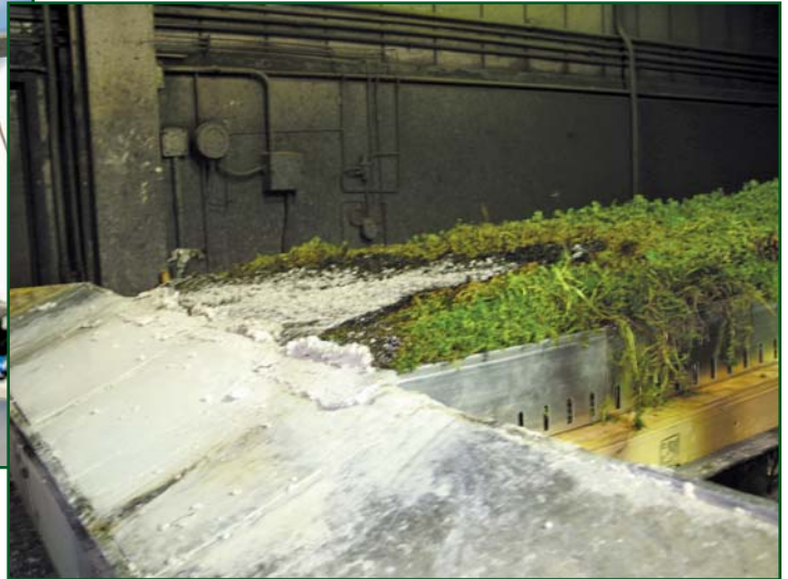
Photo 9 – Results of 10-minute ASTM E108, Spread-of-Flame Test. Fire only damaged the area of direct impingement.

direction for the future (see Photos 4-7).