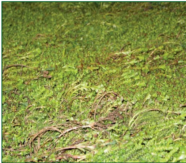
Photo 4 – Sedum planting in a 110-mph wind.

Buildings, structures, and parts thereof shall be designed to withstand the minimum wind loads prescribed herein. Decreases in wind loads shall not