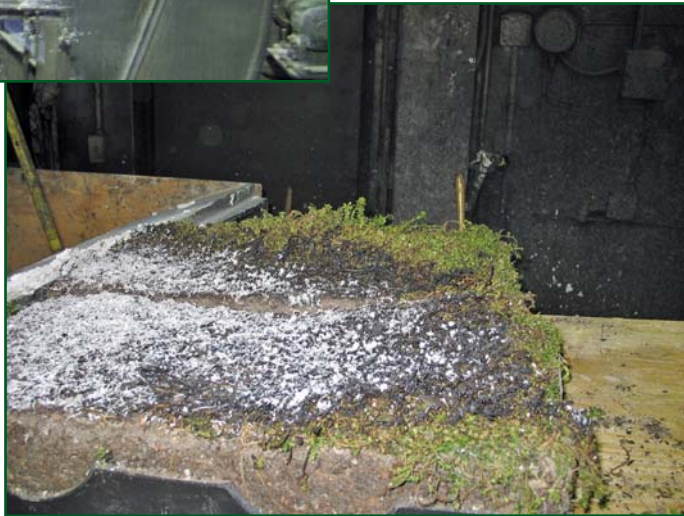
Photo 11 – No damage to anything other than the top cover exposed to direct flame.

What we have today is a history of success with little to worry about if the system is exposed to high winds. The worst case is dust and debris, the aggregate used is small and fragile, and the plants pose little or no