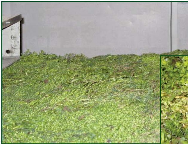
Photo 6 – Sedum planting after two hours' exposure to 110-mph wind.

Working from the last sentence of the previous section, "Roof coverings shall comply with section 1609.5.1," it states that the roof coverings shall be designed to withstand the wind pressures determined in accordance with ASCE 7. How do these systems withstand the wind pressures? Since the typical extensive system weighs about 20