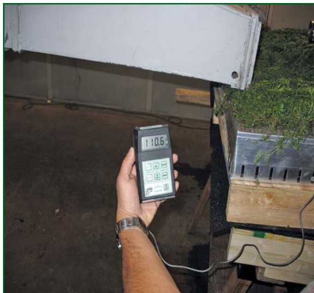
Photo 5 – Checking the wind speed.

be made for the effect of shading by other structures.