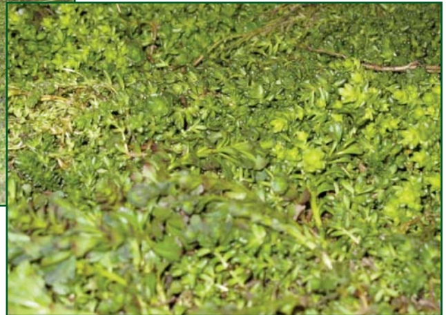
Photo 7 – Completion of the two-hour test at 110-mph wind.

ASTM D3161, Test Method for the Wind Resistance of Asphalt Shingles (Fan-Induced Method), might be modified to determine if the plants will blow out of the soil. This could determine if the soil particles will become dislodged or if the plants or mats will be uprooted. The major limitation of this test is that it provides no information on the actual resistance to uplift pressure as required by 1609.5.1. However, combin-