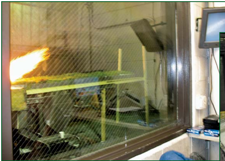
Photo 8 – ASTM E108, Class A Spread-of-Flame fire.