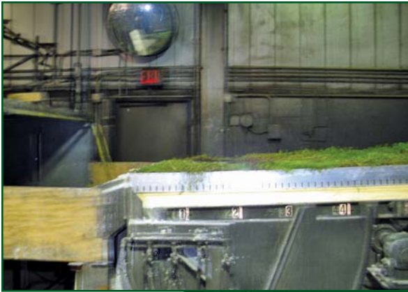
Photo 10 – Fire damage was about 2 ft, which is the area of direct impingement.

nels to get a reasonable look at industry options.