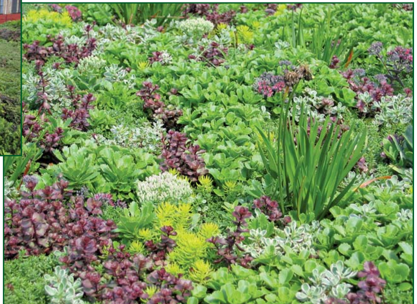
Photo 2 – Close-up of typical sedum.