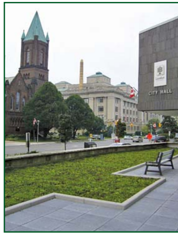
Photo 12 – Garden roof in London.

have a firebreak at every 40 m (131 ft). This can be an area of gravel or pavers 1.0 m (3.3 ft) wide across the entire roof, or a 0.3-m- (1-ft-) high fire-resistant separation wall. The fire requirements have been carefully considered and do provide a good measure of fire safety.