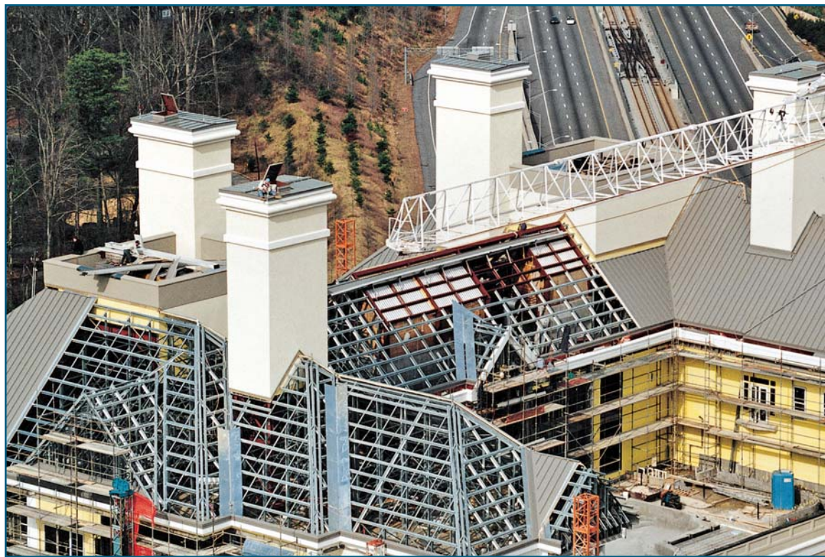
Photo 1 – Installed in commercial buildings throughout the world, roof hatches are used for a variety of purposes and can accommodate the access requirements of any application. However, unprotected openings for roof hatches create a potential fall hazard for service personnel; therefore, OSHA enforces strict regulations to protect roof openings.

stair. The method of access depends on the size and type of the structure and the hatch’s intended purpose. For example, a manufacturing facility with a high ceiling typically requires a ladder to access the roof; whereas, an office building or school might have a traditional set of stairs or a ship stair leading to the roof. Roof hatches