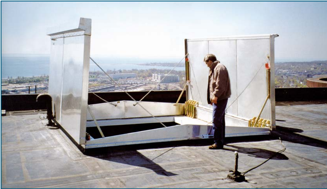
Photo 2 – Equipment-access roof hatches serve as a means of entry for large pieces of equipment and are generally double-cover models that are custom-manufactured to specific size requirements.

are installed on many nonresidential buildings, including factories, offices, shopping centers, and storage facilities. (See Photo 2 .)