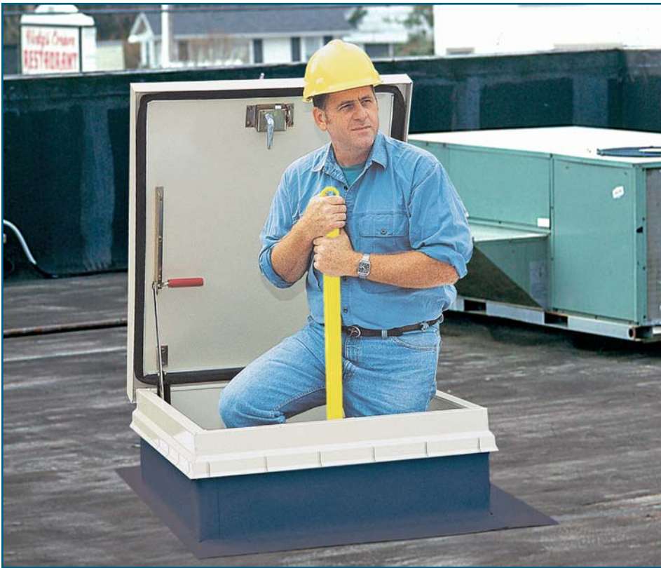
Photo 4 – The ladder-access hatch is featured here with a retractable safety post that helps ensure additional worker safety. This post permanently mounts to the top two rungs of any fixed ladder, providing a positive handhold and enabling the user to enter or exit an opening in an upright and balanced position.

have provisions for adjustability to accommodate varying mounting conditions.