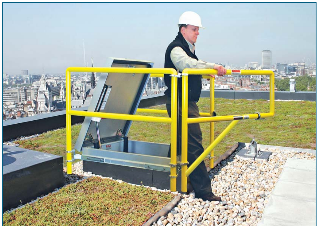
Photo 3 – This ladder-access hatch has a hatch railing system, which satisfies OSHA 29 CFR 1910.23 standard by ensuring continuous fall protection around the hatch opening.

When left in an open position, any size roof hatch can create a potential fall hazard. Workers can sustain an injury by losing